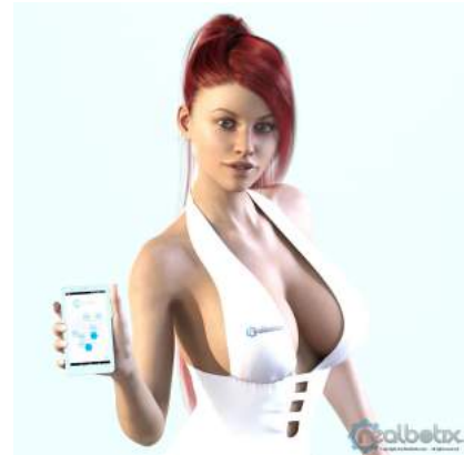
Harmony from Realbox

Appearance is the most customizable part of buying a sex robot. Options include: eye colour, pubic hair (colour and shape), ears (elf or regular), hair, skin colour and makeup. They are of a lifelike height (average around 170cm) but comparatively lightweight with the heaviest being around 70 lbs. On some sex robots the faces can be swapped. Current sex robots, like their sex doll cousins, are made from silicon rubber and are advertised as being “warm to the touch”. These robots are equipped with all over body sensors so that they can respond to touch. And sometimes the response is dependent upon the chosen personality trait of the sex robot.